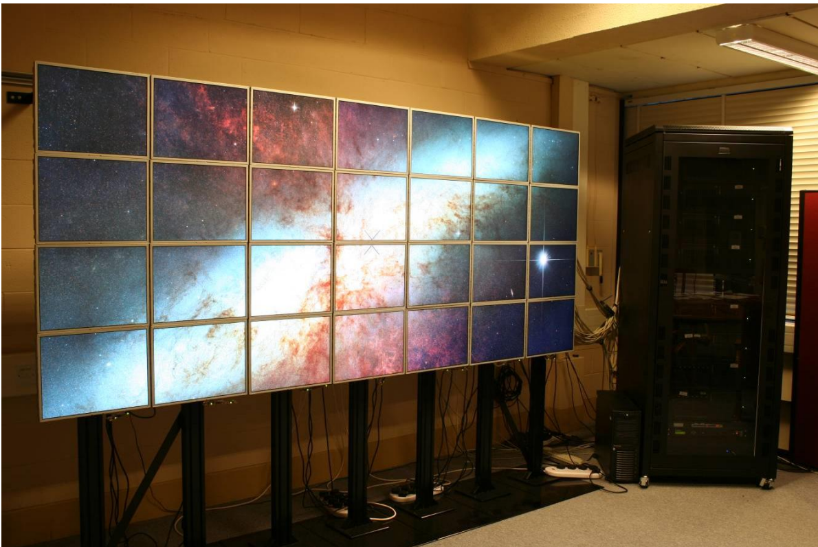
Figure 1 Powerwall with the interactive image viewer

The setup designed at Leeds was constrained by the physical dimensions of the room. A 28 panel configuration (4 vertically x 7 horizontally) of 20-inch panels was chosen to maximise the usable space of the screen. This provides a screen area of 306 x 133 cm. To drive these, a total of 7 machines were required, using two dual-output cards per machine. All machines were networked using a gigabit Ethernet switch.