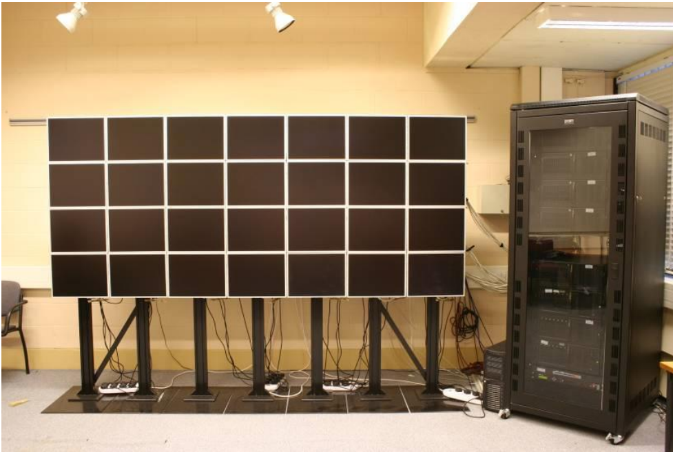
Figure 2 Front view of the powerwall