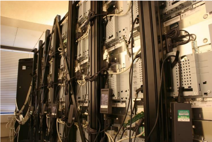
Figure 4 Rear view showing bracing

The power supplies for the monitors need to be housed at the rear of the frame assembly. Partly this is due to a desire to keep the floor clear of unnecessary clutter, but also is the result of the power supplies coming with cables insufficiently long to reach the floor. Currently these are simply stood on flat sections of the frame, but these could be zip tied for further security.