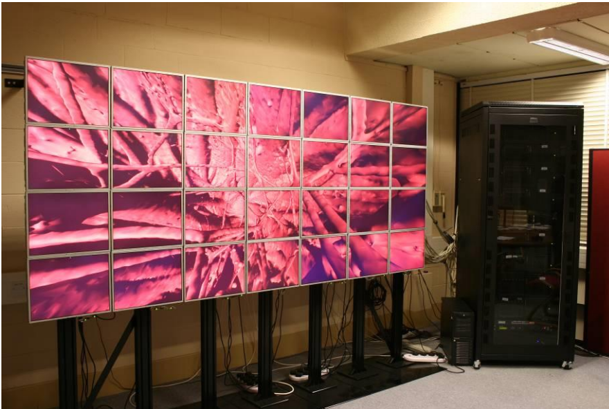
Figure 5 The powerwall displaying the MRI visualization

To view this data on the power wall we have used VTK to construct isosurfaces in the MRI data, which were then smoothed and decimated. A custom written VRJuggler application was then used to load these surfaces. Histology slices were given transparent backgrounds and have been added to the MRI visualisation to provide the user with better context of what they are seeing. Through use of a wireless joypad navigation in 3-d space, plus control of clipping planes are easily achieved.