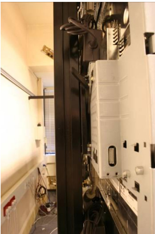
Figure 3 Side view of monitor mount