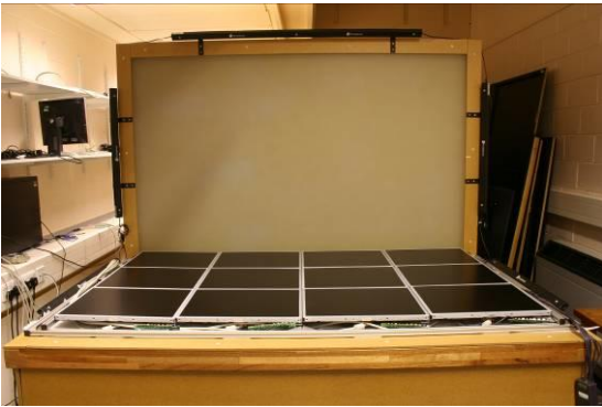
Figure 6 The powertable with IS900 trackers

In addition to the main power wall, an additional power-table has been constructed. While being physically smaller (4 x 3 monitor arrangement) it is in other respects very similar in design to the main wall. This has been placed within an Intersense IS-900 tracked region. The high resolution of this 6-DOF tracking system (0.75mm / 0.05°) combined with the high resolution of the display should prove to be compelling for interacting with high resolution data sets.